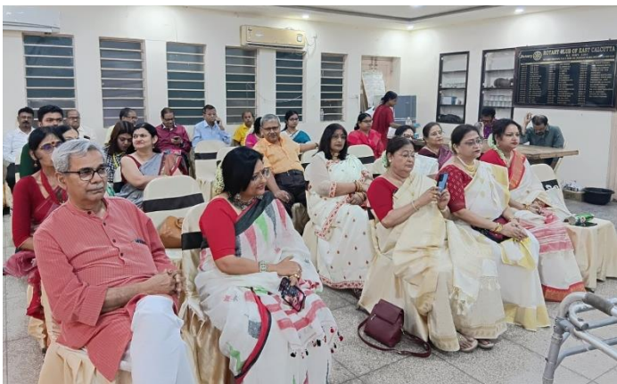
Rotary Club of East Calcutta celebrated Rabindra Jayanti on 13 th May at 6.30PM at their club premises with different types of cultural programs and recitations. 30 Rotarians with their guest were present in the evening. It was a beautiful evening and people were enjoyed a lot.