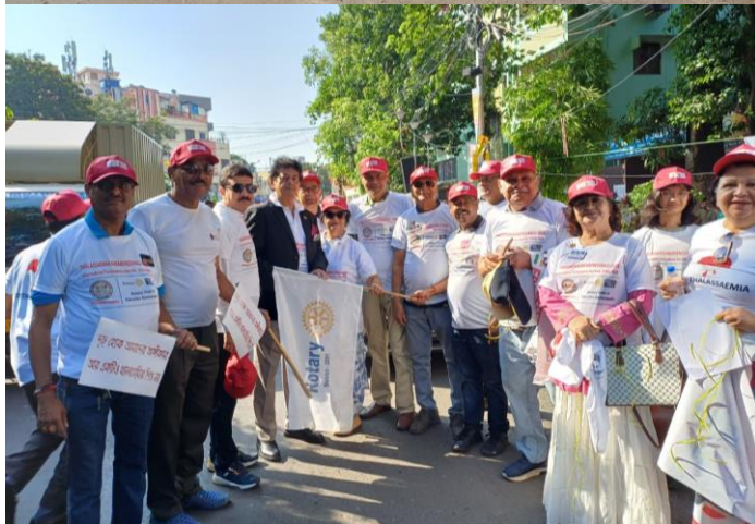
On the occasion of International Thalassaemia Day, Rotary Club of East Calcutta organized a Thalassaemia Awareness Car Rally 2025-26 jointly with Rotary Club of Calcutta Kankurgachi on 8 th May 2026 under the aegis of Rotary International District 3291. Hon’ble District Governor Rtn. Ramendu Homchoudhuri gracefully flag off the Rally from Rotary Bhavan at 8am. Objectives of the Rally were “Drive for awareness, drive for prevention –towards a Thalassaemia free tomorrow”. 40 cars with more than 100 Rotarians from different clubs participated the Rally. Rally ended with certificate and medal distribution at RC East Calcutta premises.